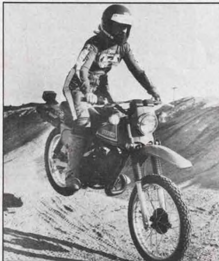
As with most dual-purpose motorcycles, the forks were too soft for the whoops, and the rear end hopped around to boot.