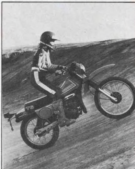
Our TS had a very surprising motor, which was very strong for a 125 dualer.