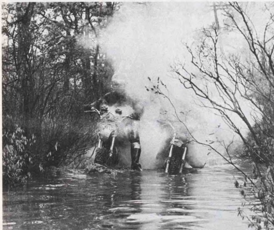
"Say, aren't you Phoebe Zeit-Geist?"