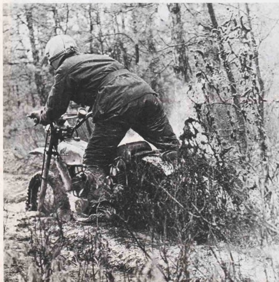
Typical motorcycle enthusiast "going for it."