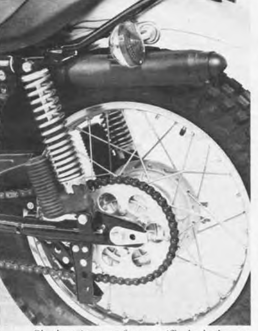
Shock springs are far too stiff: the brakes too grabby and the turn signals too vulnerable.