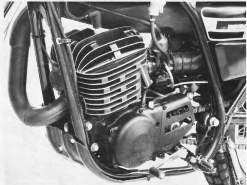
The heart of the DT 400B is its engine-gobs of torque with controllable power.