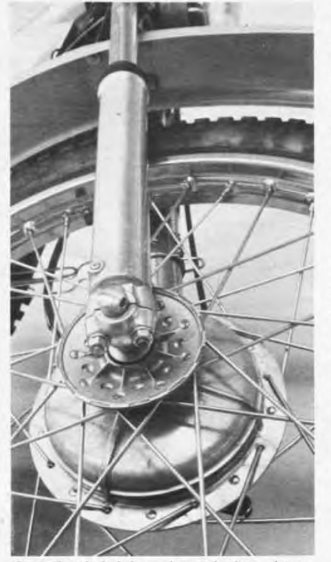
Conical style hub has a bigger brake and is too touchy. Fork action is good, springs bad.

the DT-1 brought home many thousands of trophies for enduro riders in every part of the country. The new era began.