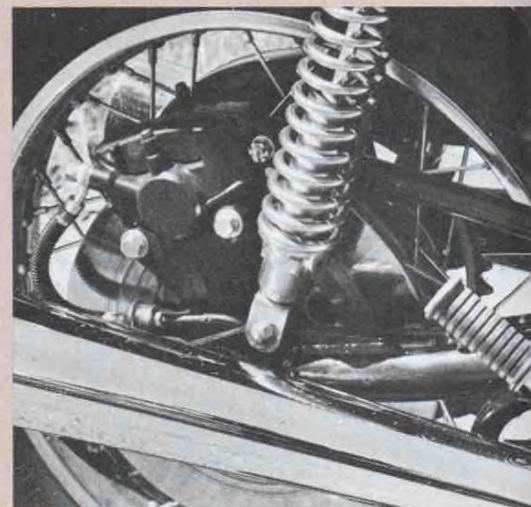
Rear disc brake should prove to be a strong bargaining lever against rival multi-cylinder models.