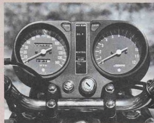
Speedometer and tachometer are canted toward center and at night are illuminated in red, for improved vision.