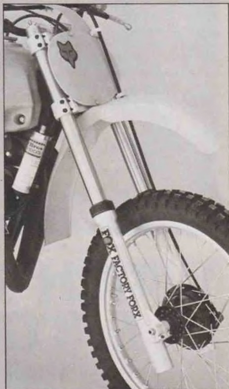
The new Fox Forx sport giant 44mm stanchion tubes and forged aluminum triple clamps and sliders.

The internal parts on the Fox Forx are as impressive as the external. The long